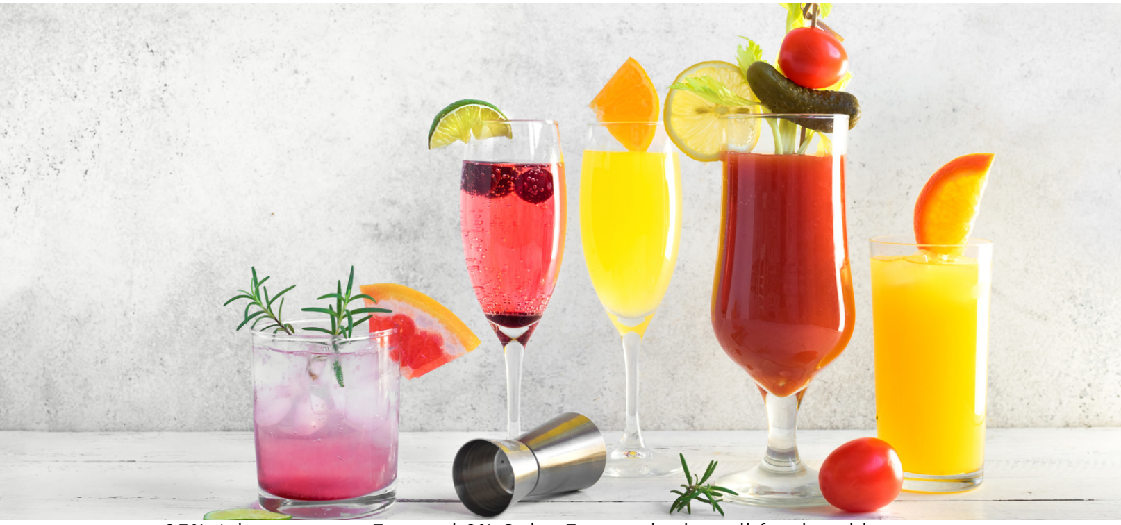
++23% Administrative Fee and 8% Sales Tax applied to all food and beverages. A 3% discount will be applied to all cash, check, and ACH payments.

Mimosa | Bloody Mary | Irish Coffee 2 Hours $16pp++ | 3 Hours $24pp++