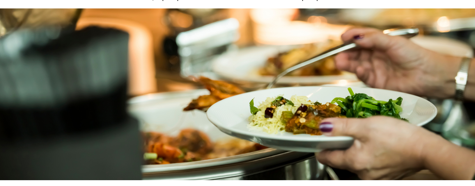
++23% Administrative Fee and 8% Sales Tax applied to all food and beverages. A 3% discount will be applied to all cash, check, and ACH payments.

$31++ per person +$5 per person for buffet of less than 20 people