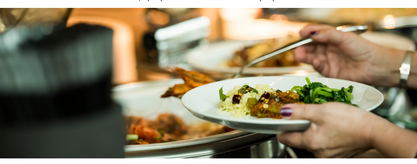
++23% Administrative Fee and 8% Sales Tax applied to all food and beverages. A 3% discount will be applied to all cash, check, and ACH payments.

$31++ per person +$5 per person for buffet of less than people