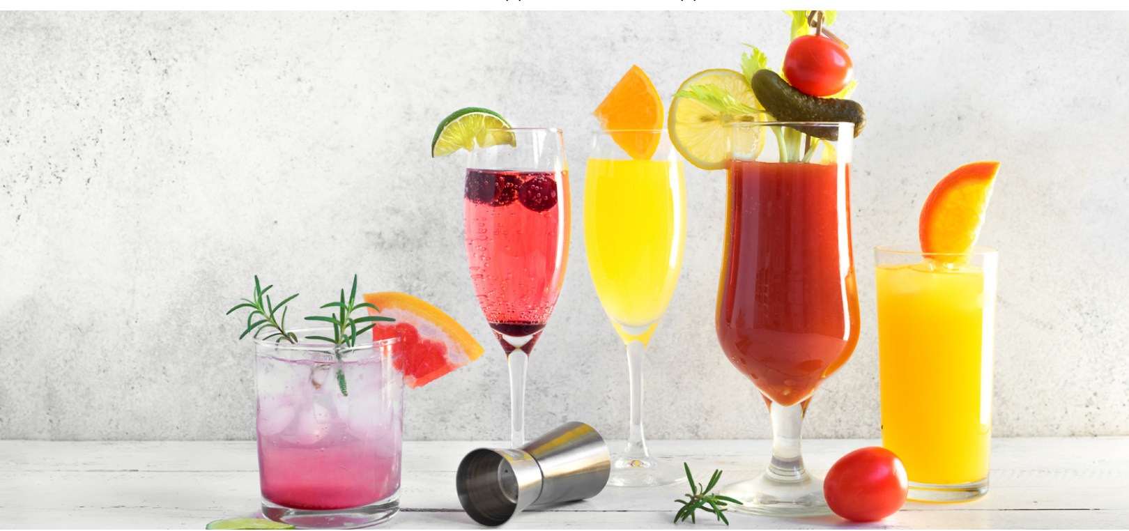
++23% Administrative Fee and 8% Sales Tax applied to all food and beverages. A 3% discount will be applied to all cash, check, and ACH payments.

Mimosa | Bloody Mary | Irish Coffee 2 Hours $16pp++ | 3 Hours $24pp++