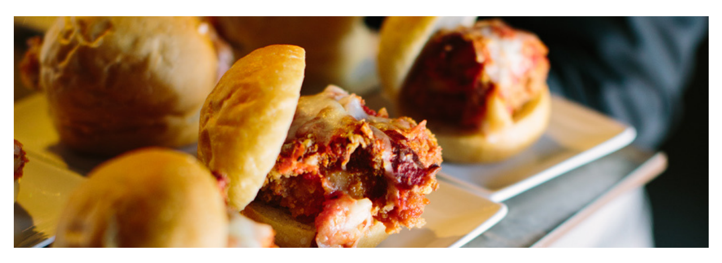
++23% Administrative Fee and 8% Sales Tax applied to all food and beverages. A 3% discount will be applied to all cash, check, and ACH payments.